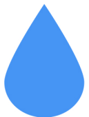
COLUMBIA CONTACT BLUE