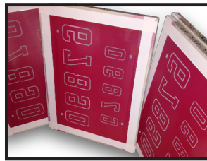
Complete kits include pre-exposed screens. Choose from 7 available fonts.

Film positives, blank screens also available