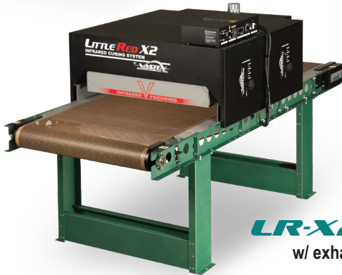
LR-X2-30 w/ exhaust