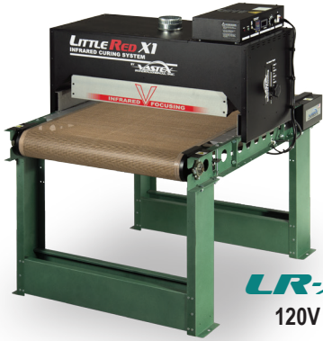
LR-X1-30 120V available