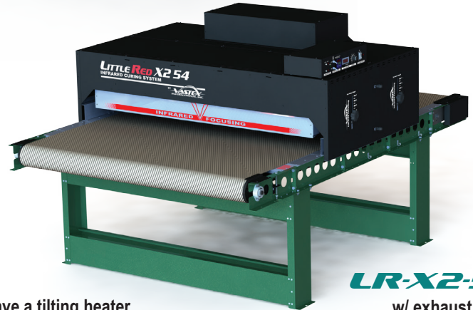
LR-X2-54 w/ exhaust

All LittleRed series dryers have a tilting heater design. Works great for curing hats!!